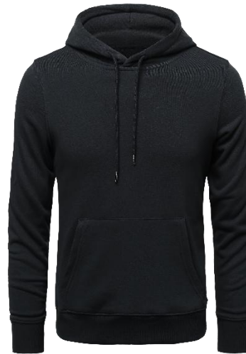
Bulletproof Casual Hoodie