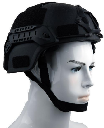
Bulletproof MICH Helmet