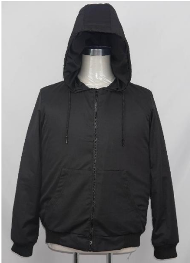
Bulletproof motorcycle Hoodie