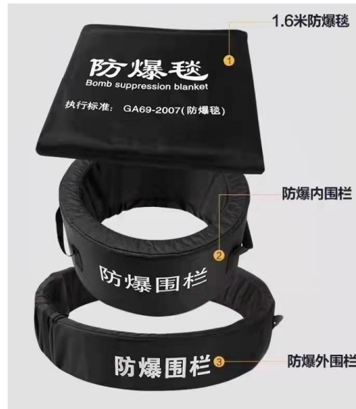
Bomb Suppression Series