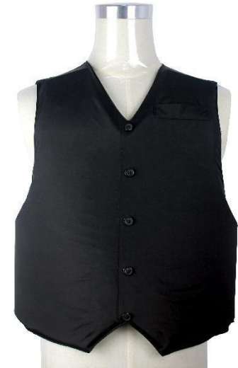
Bulletproof Suit Vest