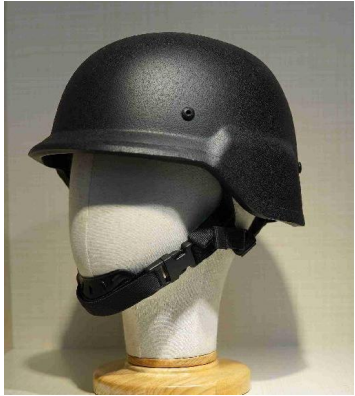
Bulletproof PAGST Helmet