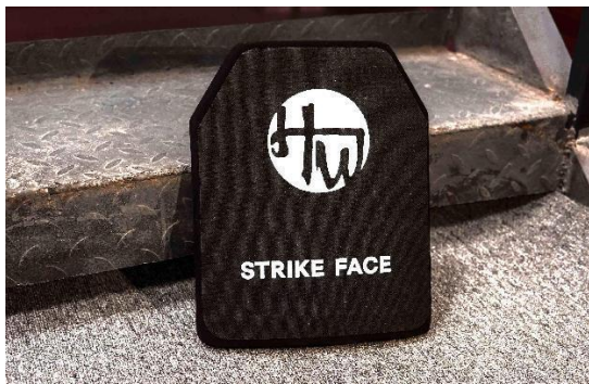
Bulletproof Plate Hard Armor

Hard armor normally made with ceramic or ballistic steel. Armor Plates is rated highly for protecting the users against high-caliber rifle ammunition.