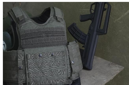
Bulletproof Vest / Gear

Soft armor is usually quite flexible and soft, be used in concealment vests, and be used as a panel together with hard armor for minimizing the blunt force trauma.