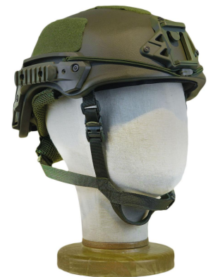
Bulletproof WENDY Helmet