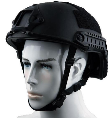
Bulletproof FAST Helmet

Bulletproof helmet is made of high strength UHMW-PE. The bulletproof helmet has less weight, more sizes and gives you more comfortable wearing experience. Customers can choose their own sizes and other accessories such as tactical rails, night-vision device, flashlight. Helmet paintings can be customized.