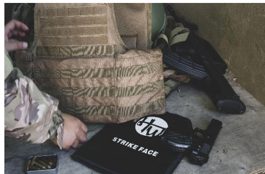
Bulletproof Panel Soft Armor

Hard armor normally made with ceramic or ballistic steel. Armor Plates is rated highly for protecting the users against high-caliber rifle ammunition.